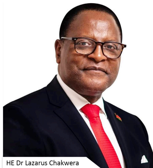
HE Dr Lazarus Chakwera

The effects of the Pandemic have not spared MMD's work. The containment measures that have been adopted world-over have meant that travel has been restricted as has the holding of physical meetings. Although digital platforms have been used instead for consultations, their limitations have slowed down the progress of the Compact II development work.